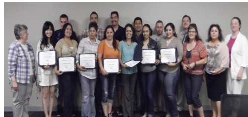
Bridge to Manufacturing Class