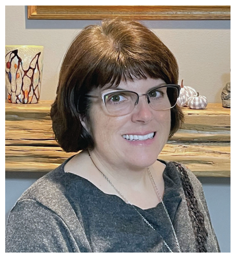
"It's a different way of delivering the same material and evaluating, and breaks the monotony up."

In search of interactive activities, they created virtual escape rooms. "Students loved them! We made a scenario and locked them onto a page until they answered questions correctly and got a numerical key that would take them to the next page.