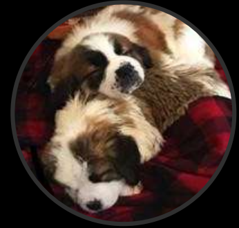
BACON + SHOOTER