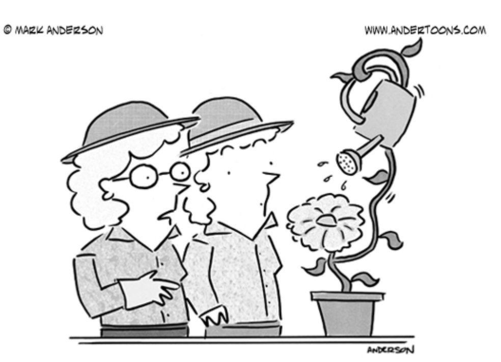
"It's convenient, but have we gone too far?"

Any activity carried on primarily for the convenience of organization's members, students, patients, officers, or employees